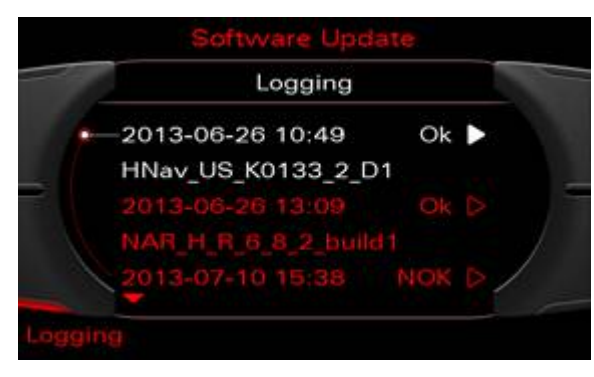
Figure 4. Software update log showing a successful software installation.

After a successful update, the screen will show the date on which the update was performed and the software that was installed (HNav_US_K0133_X_XX — The X characters will be one of several different numbers or letters). 'Ok' will be listed on the right. If K0133 does not have any rows with 'Ok', the update must be retried until it is successful.