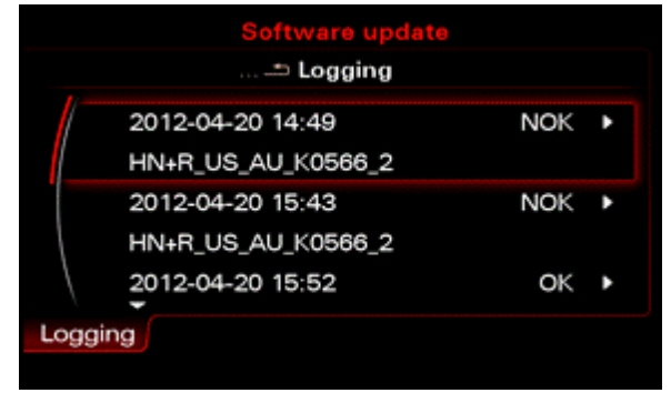
Figure 5. Software update log showing 2 failed attempts before a successful installation (MMI 3G+ screenshot used as reference).

Tip: If the update must be performed two or more times because the modules are not updating correctly, a screenshot of the software update log is required (Figure 5). This should be kept on-hand for warranty auditing purposes. To take a screenshot, insert an SD Card into slot 1 and press and hold the left and right arrow keys at the same time. All 4 softkeys will flash when the screenshot is taken. A screenshot should be taken of each page in the logging display.