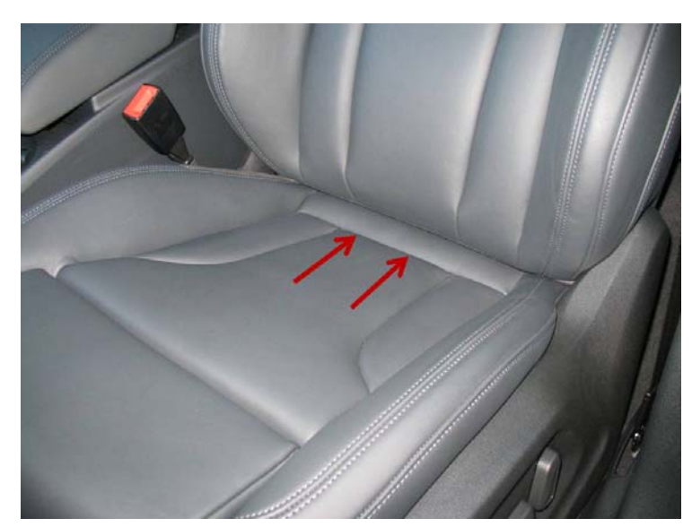
Figure 1. Arrows show area where additional fastening clips were added.

As a consequence of this change, the temperature sensor within the seat was moved to a location that is more sensitive to heat. As a result, the control limit is reached too early and the heat is reduced before the seating surface reaches the correct temperature.