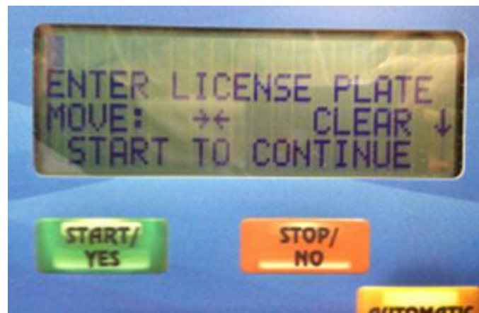
Figure 7. Enter license plate screen.