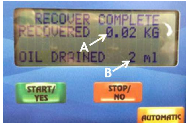
Figure 3. Amount of refrigerant recovered (A), and amount of oil drained (B).