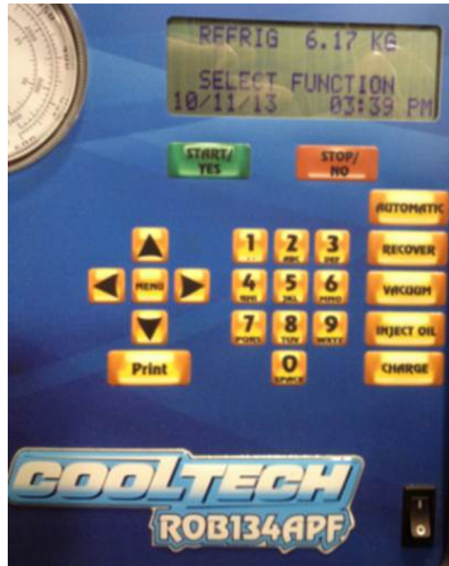
Figure 1. Date and time screen.