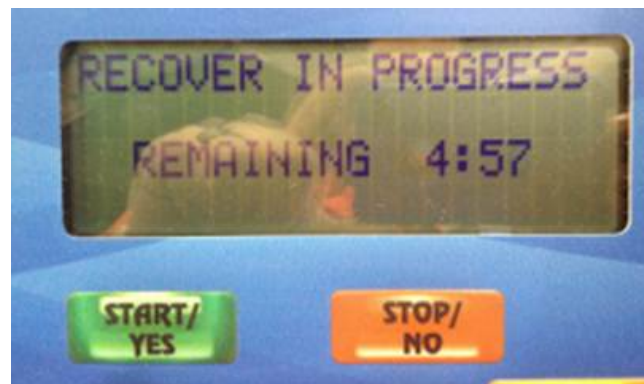
Figure 2. System recover in progress.