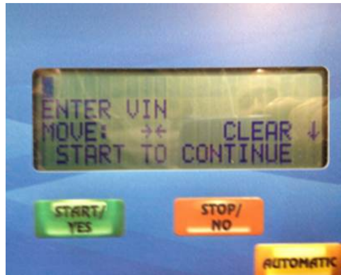
Figure 6. Enter VIN screen.