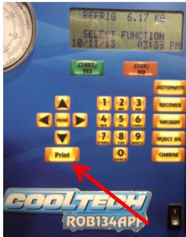
Figure 4. Location of the Print button.