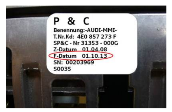
Figure 2. Location of the production date.