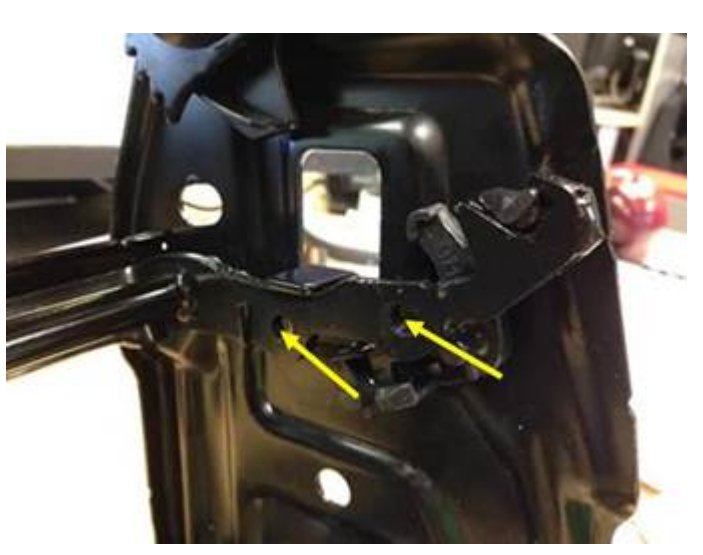
Figure 4. Bracket in incorrect position.