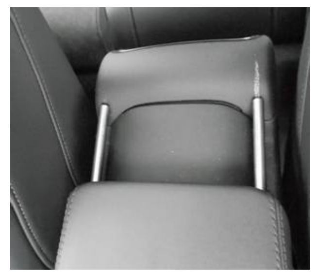
Figure 1. Detached rods that have pulled out of the armrest cover.