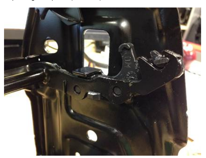
Figure 3. Bracket in correct position.