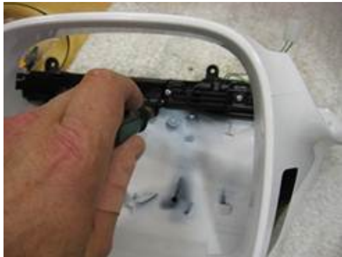
Figure 8. Removing the turn signal lamp.