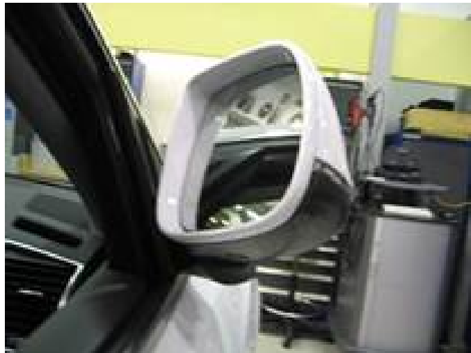
Figure 2. Exterior rear view mirror manually folded.