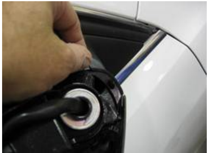
Figure 6. Application of felt tape.