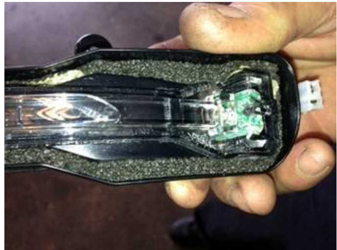
Figure 10. Turn signal lamp with sealing foam tape installed.