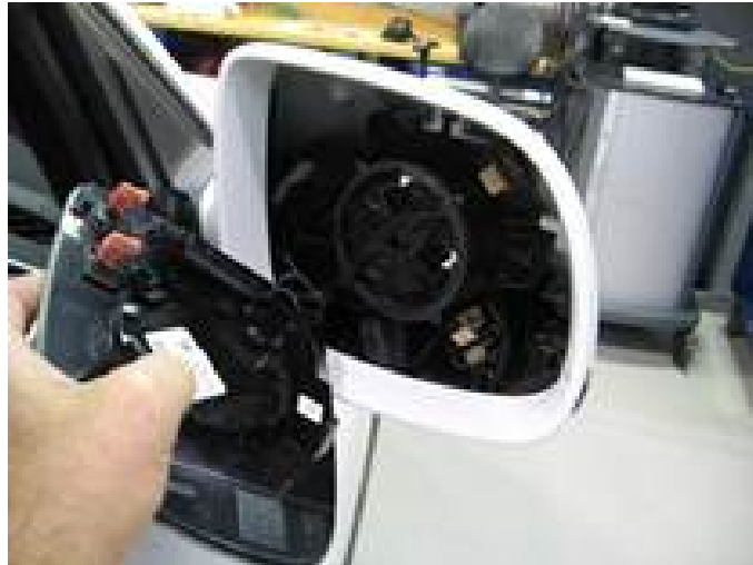
Figure 1. Exterior rear view mirror glass removed.