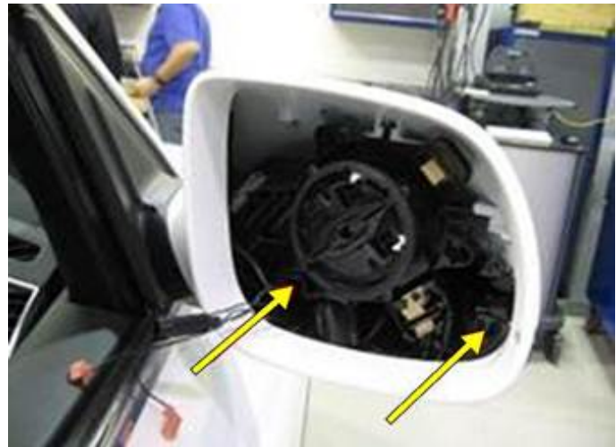
Figure 3. Location of the retaining clips.