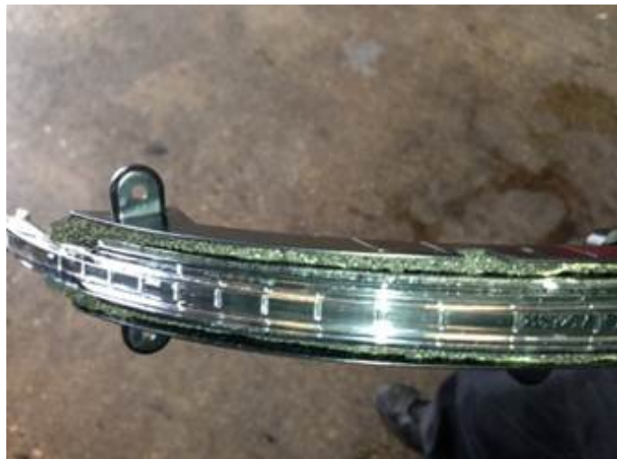
Figure 9. Turn signal lamp with sealing foam tape installed.