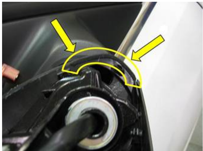
Figure 7. Felt tape applied.