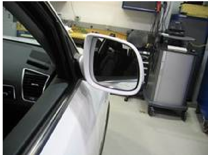
Figure 11. Mirror reassembled.

Tip: Exercise care in the reassembly process. Incorrect or incomplete reassembly will cause recurrence or additional wind noise from the mirror assembly.