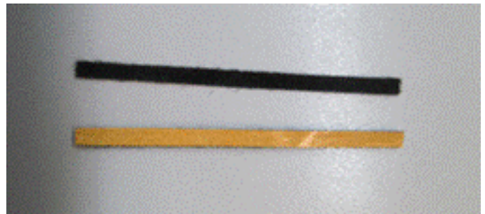
Figure 5. Strips cut from felt tape.