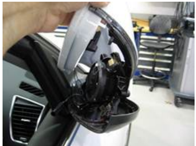
Figure 4. Removing the mirror cover.