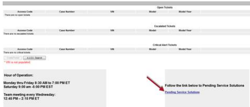
Figure 2. Technical Assistance page