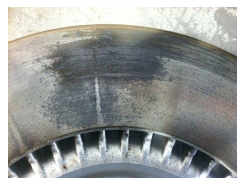
Figure 1. Brake pad marks on brake disc.

Front brake disc: 4G0615301A Rear brake disc: 4H0615601H