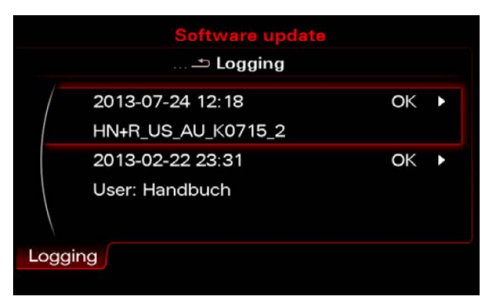
Figure 5. Software update log showing a successful software installation.

5. Verify that the software update has been completed successfully by accessing the logging page (Figure 5). To access this screen, proceed to step 8 in TSB 2028141 and press the lower left softkey. A successful update will show the date the update was performed, the software that was installed (HN+R_US_AU_K0715_X), with 'OK' listed on the right. The 'X' may be one of several different numbers. If K0715_X does not have any rows with 'OK', the update must be retried until it is successful.