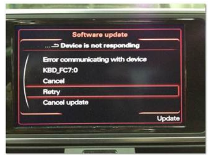
Figure 3. A device requiring a 'Cancel' selection.

Some earlier model year 2012 vehicles or vehicles equipped with Bose sound systems may experience certain modules that will not update properly during Step 16 of TSB 2028141. If this should occur, either choose 'Cancel' (Figure 3), or 'Skip device' (Figure 4), depending on the type of error. Do not choose 'Cancel update', as this may cause the software update to fail entirely. After the update is finished and the summary page is shown, select 'Retry' at the bottom of the list if it is available to attempt to update the modules again. If 'Retry' is greyed out, then the software update was successful, so select 'Continue" to proceed. In some cases 'Retry' may have to be repeated two or three times to get all modules to update successfully.