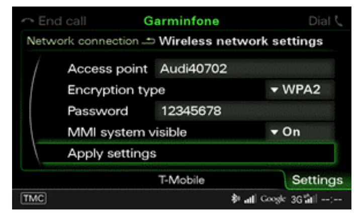
Figure 2. Wireless network settings.

3. As part of the update, wireless settings and paired devices will be deleted. All devices will need to be re-paired after the update, and all wireless settings restored to the customer's settings. To access the Wireless Network Settings on the MMI (Figure 2), press TEL >> Settings >> Wireless network connection >> Wireless network settings. Record all settings so they can be re-entered at the end of the procedure.