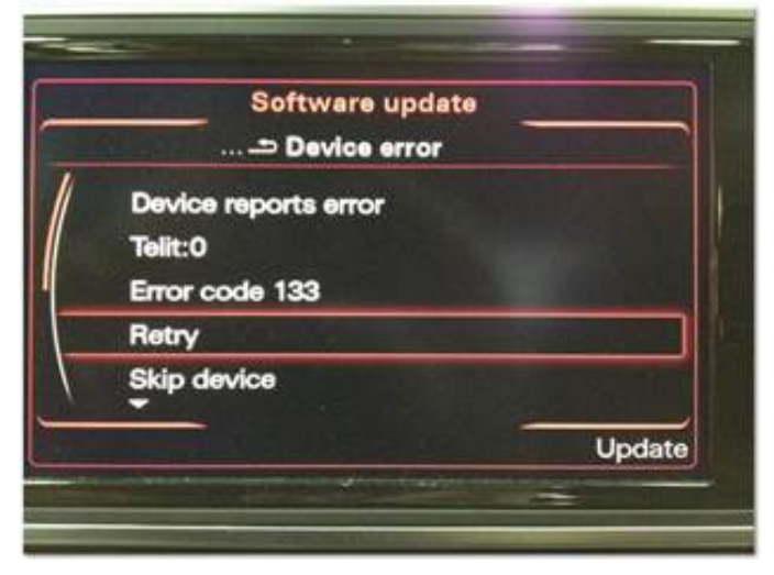
Figure 4. A device requiring a 'Skip device' selection.