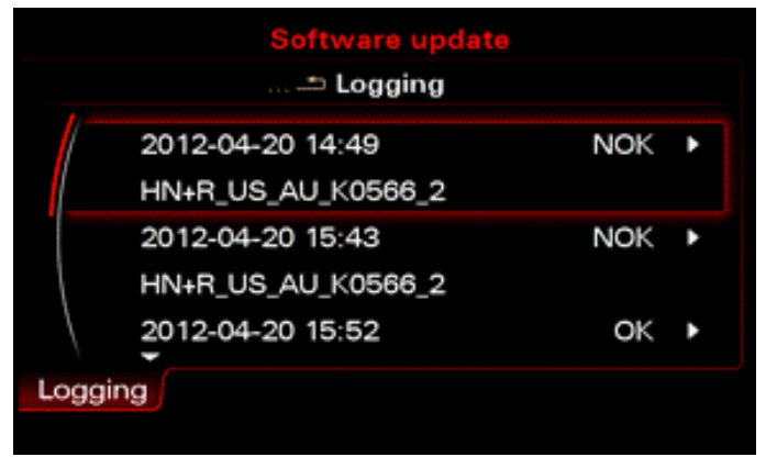
Figure 6. Software update log showing 2 failed attempts before a successful installation.

Tip: If the update must be performed two or more times due to modules not updating correctly, a screenshot of the software update log is required (Figure 6). This should be kept on-hand for warranty auditing purposes. To take a screenshot, insert an SD Card into slot 1 and press and hold the left and right arrow keys at the same time. All 4 softkeys will flash when the screenshot is taken. A screenshot should be taken of each page in the logging display.