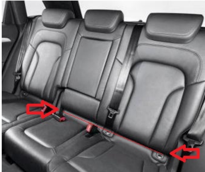
Figure 1. Left rear seat noise area marked with red arrows.