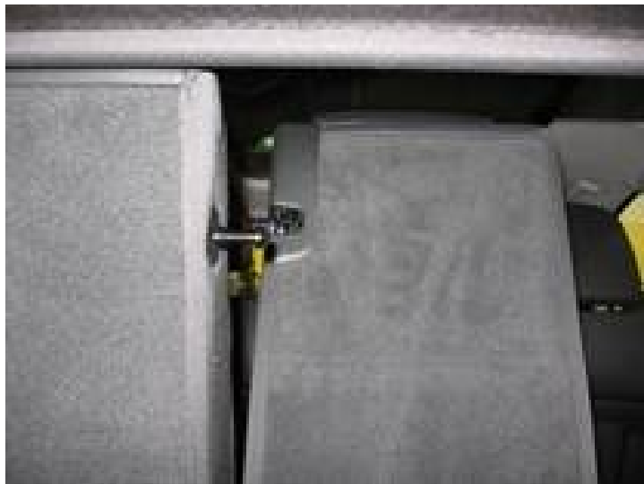
Figure 2. Armrest lock striker pin.