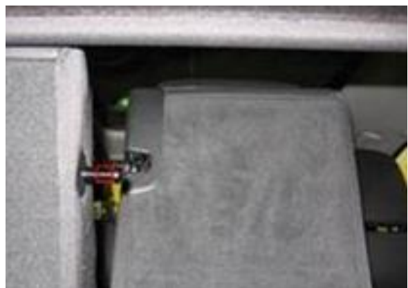
Figure 4. Area of striker pin to be lightly sanded.