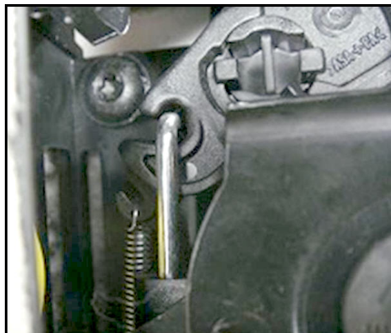
Figure 4. The optimized connection point of the release lever and the connecting rod.