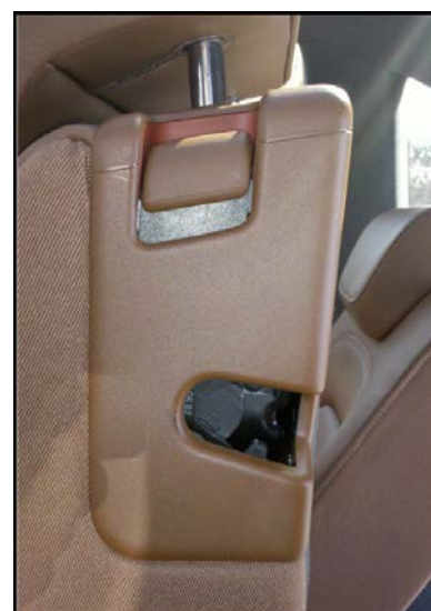
Figure 1. The rear center backrest latch and release lever.

The loose connection inside the latching mechanism can create noises from the rear center seat when the vehicle is driven over rough roads.