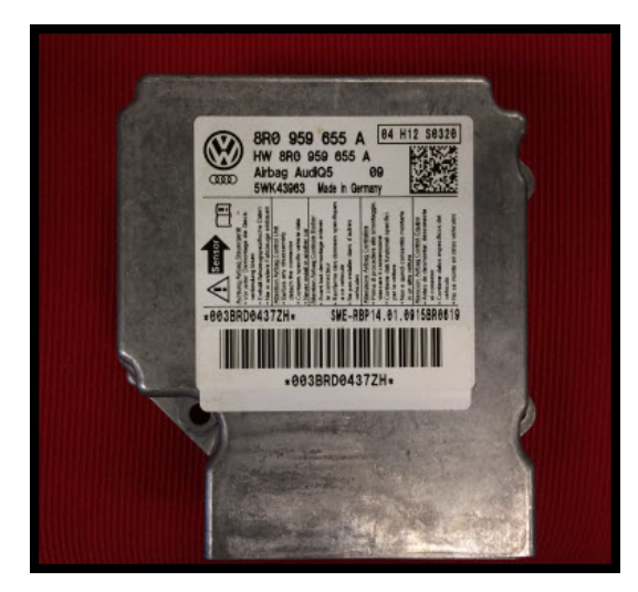
Figure 3. Production Control Unit

Tip: The color code indicates the ECU software that the control module must be programmed with to operate correctly in the North American Market. Only control modules to be used for service will have a color code. In addition, service parts will have a secondary label placed over the original supplier label after the part has been programmed for the North American market (Figure 3 and Figure 4).