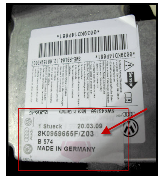
Figure 4. Service Part Control Unit