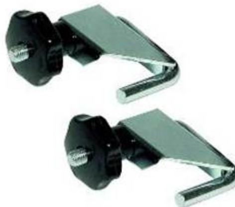
Figure 2. Tool -3094-, hose clamps.