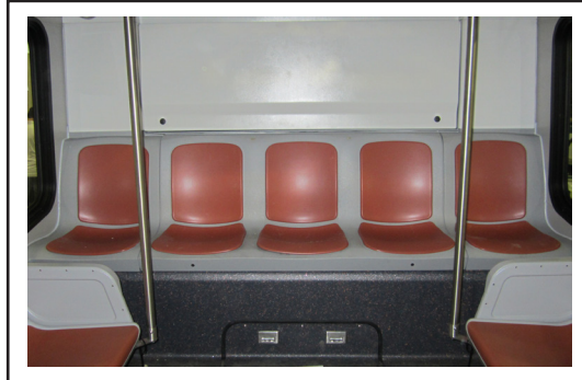
Figure 1 - View of the Five-Passenger Rear Seat