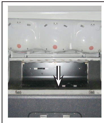
Figure 2 - Rod Support Location Under Rear Seat