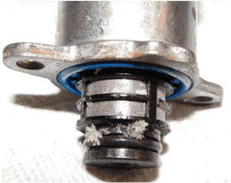
Fuel Pressure Regulator 1 Contaminated With DEF