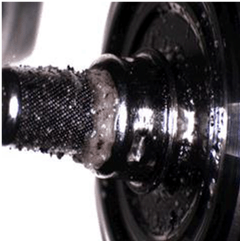
Fuel Pressure Regulator 2 With DEF Contamination