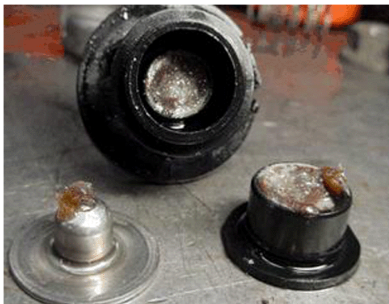
Fuel Pressure Regulator 1 Contaminated With Diesel Exhaust Fluid (DEF)

A dealer may encounter a customer's concern of hard start, no start, rough running, low fuel pressure and/or DTCs P0087, P0088, P0191 and P128E. During inspection of the fuel system and its components, the dealer may find contamination. Below are examples of contamination that has been found in returned parts and what we believe to be the source of the contamination.