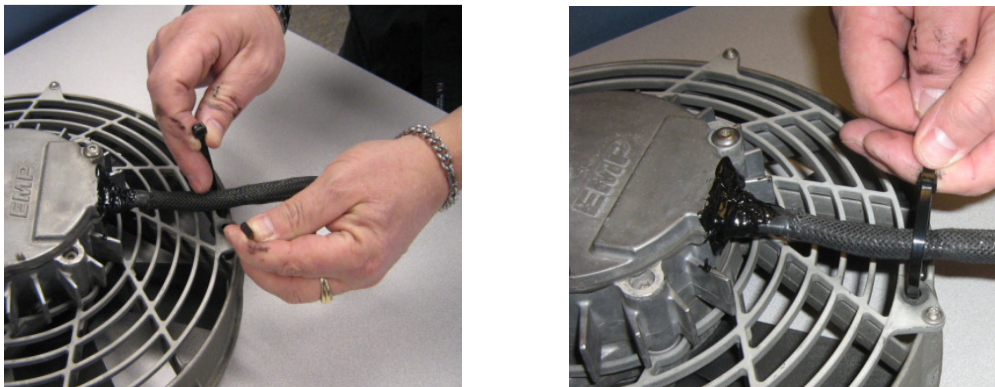
Figure 7: Harness Securing