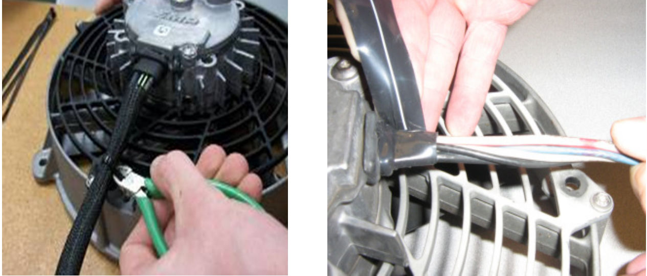
Figure 3: Fan Harness Preparation