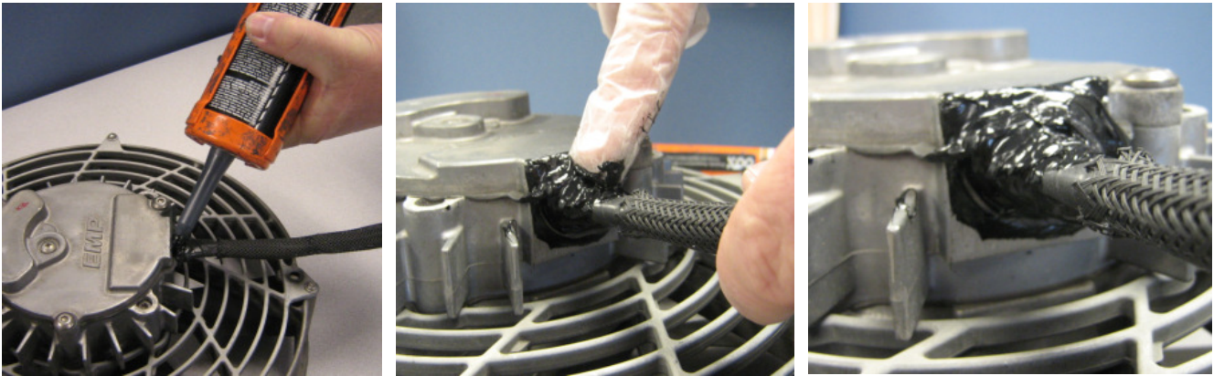
Figure 5: Adhesive Application, Fan End