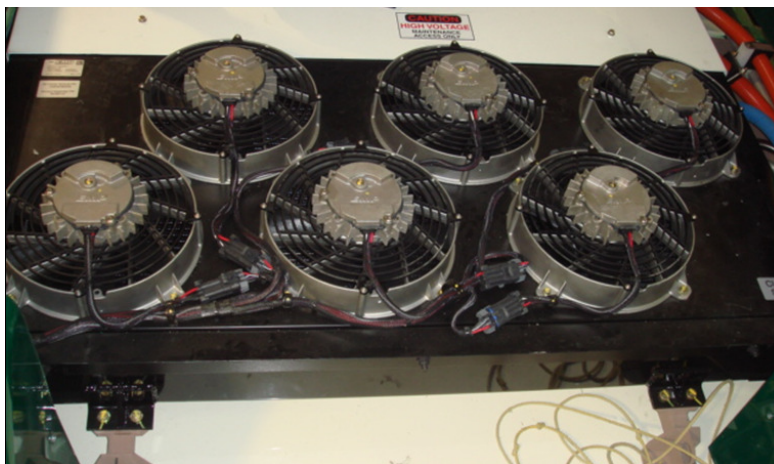
Figure 2: EMP OK6 Oil Cooler Unit