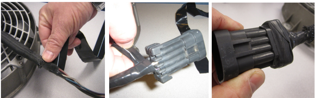
Figure 4: Fan & Main Harness Connector Wrap