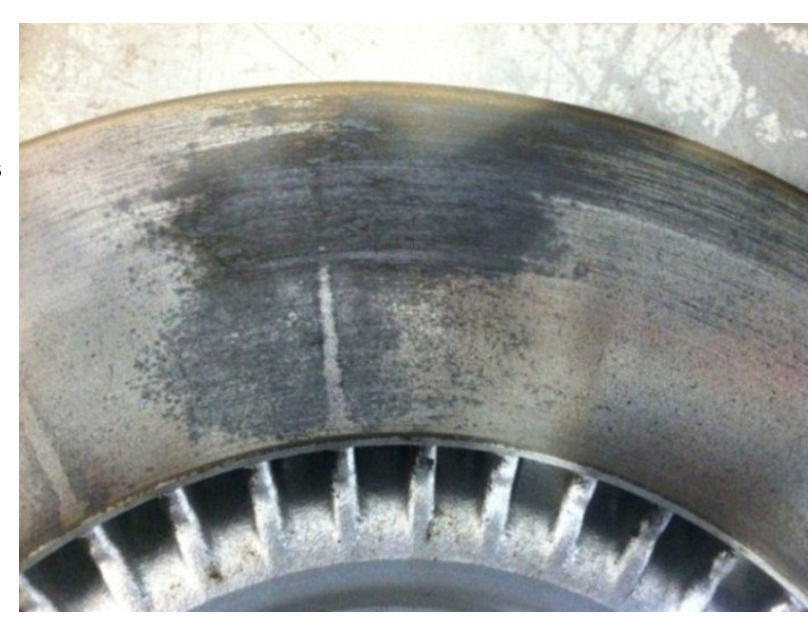
Figure 1. Brake pad marks on brake disc.