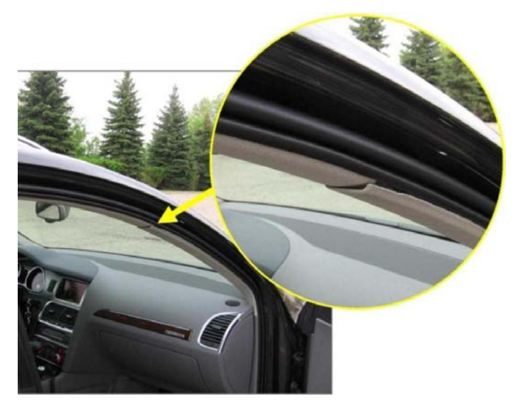
Figure 5. Loose A pillar trim.

If the A pillar trim on either side of the vehicle is loose or ill-fitting as shown at right (Figure 5), replace the trim.