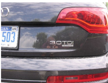
Figure 1. Wrong labeling.

The emblem package on the rear lid of certain model year 2013 Audi Q7 3.0 TDI vehicles is incorrect (Figure 1). The labeling “3.0 TDI Quattro” was installed on the right side of the rear lid. The correct emblem is displayed in Figure 2.