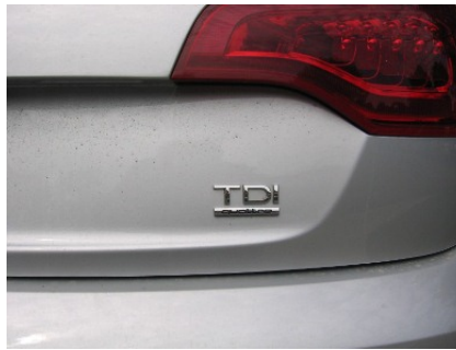
Figure 2. Correct labeling should be “TDI Quattro” without “3.0”.