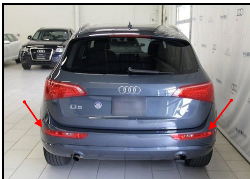
Figure 1. Rear side marker lights.

A “bulb out” warning is active in the instrument cluster’s Driver Information System (DIS) display and one or both of the rear side marker lights are burnt out.