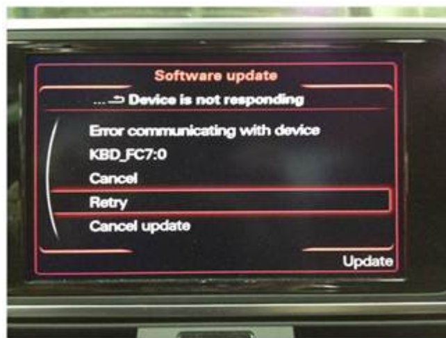
Figure 2. A device requiring a 'Cancel' selection.

Some earlier model year 2012 vehicles, or vehicles equipped with Bose® sound systems may experience certain modules that will not update properly during Step 16 of TSB 2028141. If this should occur, either choose 'Cancel' (Figure 2), or 'Skip device' (Figure 3), depending on the type of error. Do not choose 'Cancel update', as this may cause the software update to fail entirely. After the update is finished and the summary page is shown, select 'Retry' at the bottom of the list if it is available to attempt to update the modules again. If 'Retry' is greyed out, then the software update was successful, so select 'Continue' to proceed. In some cases 'Retry' may have to be repeated two or three times to get all modules to update successfully.