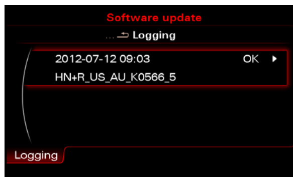
Figure 4. Software update log showing a successful software installation.