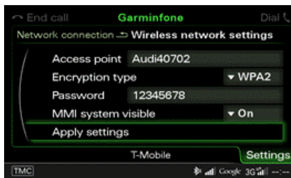
Figure 1. Wireless network settings.