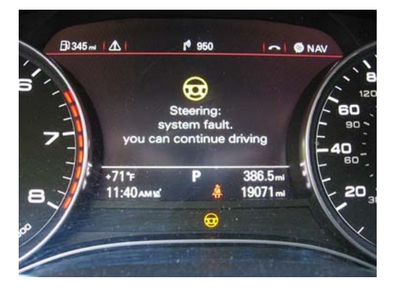
Figure 1. Yellow steering symbol and cluster message.

The yellow steering symbol is illuminated in the instrument cluster. A DTC C10ACFO – steering end stops not programmed is stored in address word 44 power steering (J500).