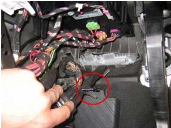
Figure 1. Wire harness in driver footwell area.

There are two known sections in the wiring harness that can be affected, but the potentially affected areas are not limited to these two known sections. One of the known sections is in the driver's footwell area where the wire harness enters the interior of the car from the engine bay (Figure 1).