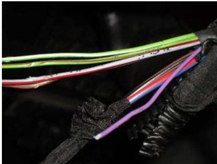
Figure 2. Wire harness under driver's side headlight.

The second known section is in the wire harness located under the driver's side headlight (Figure 2).