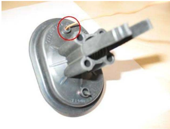
Figure 5. Seal off access hole in grommet with Butyl sealant.