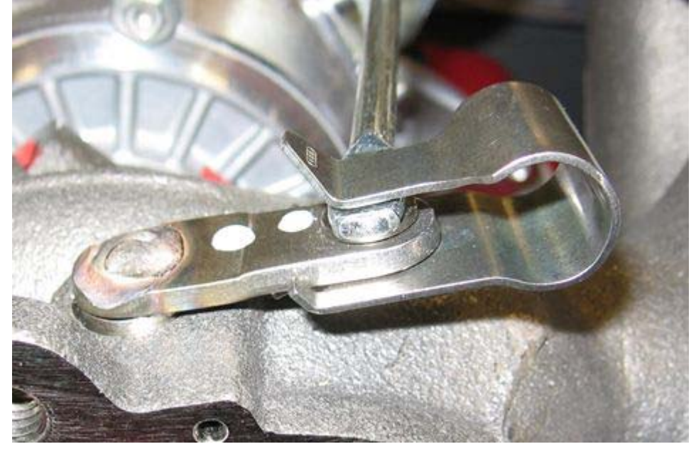
Figure 4. Correctly fitted clip.

• After fitting the spring clip check the position of the original circlip (Figure 3, 2) and correct it if necessary.