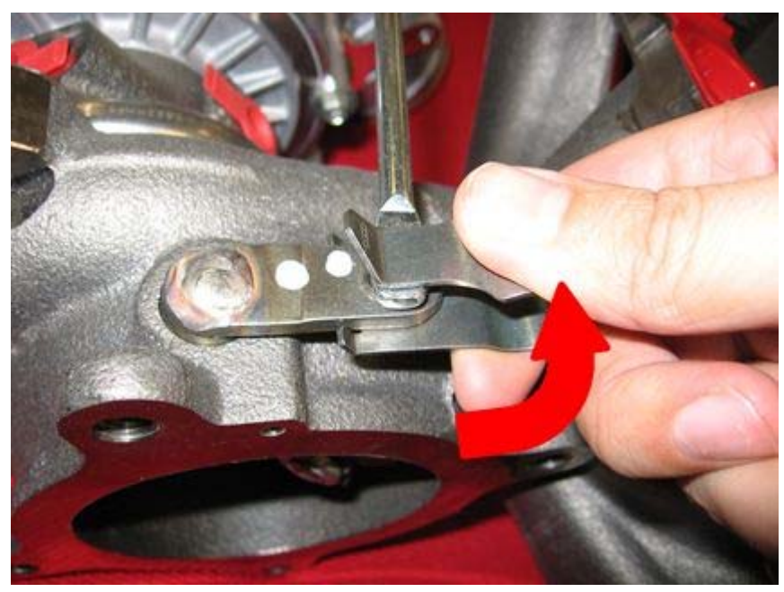
Figure 2. Turn the clip counter clockwise till the lugs slot in.