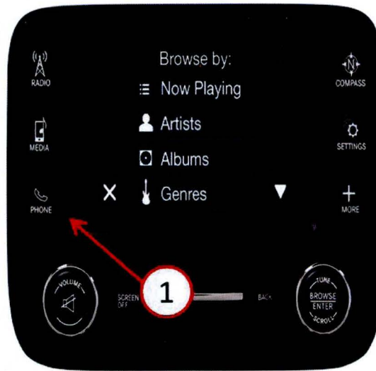
Fig. 2 Radio sales code RA2

1 - RA2 radios will have this phone button.