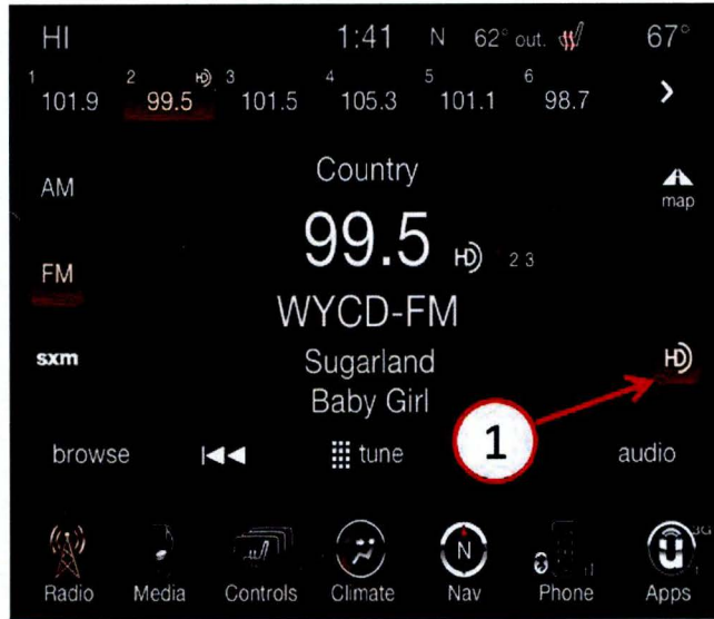
Fig. 4 How to tell if the radios is an RA4

1 - RA4 radios will have this HD) symbol.