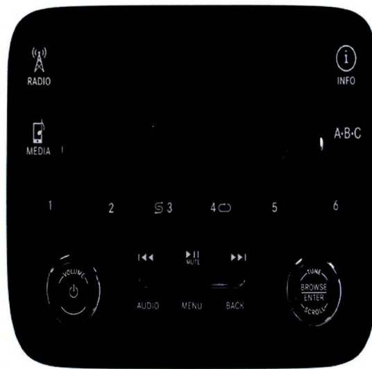
Fig. 1 Radio sales code RA1