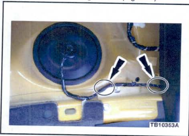
Figure 1 - Article 12-11-12