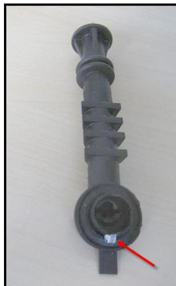
Figure 3. White mark on locating tab.

Service parts have been checked, but it is still possible to receive unchecked parts. Corrected parts will be marked in white on the locating tab. This tab must be pointing down (Figure 3).