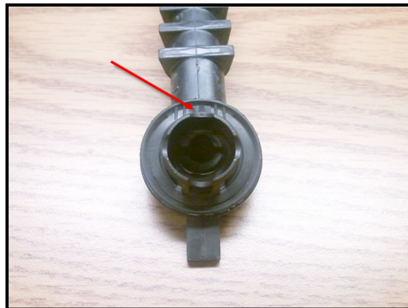
Figure 1. Incorrectly assembled drain hose, with locating tab pointing up.