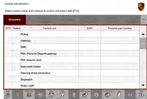
Control unit selection