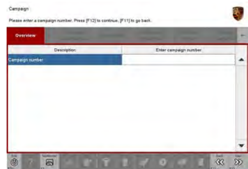
Programming number input field