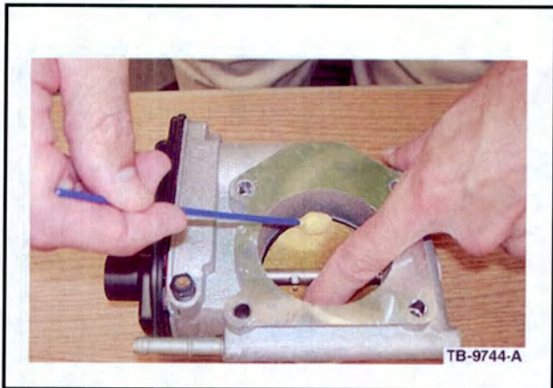
Figure 2 - Article 12-8-1