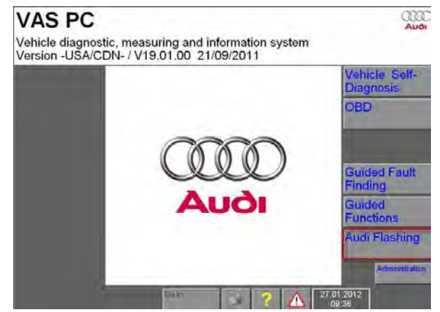
Figure 2. Audi Flashing.

Tip: If you do not have the latest Base/Brand CD installed on the tester, then the SVM code may fail and return an "ASM-MCD base system error" because the tester is not capable of reading the software flash file. Starting with the model year 2010, some software files have changed and cannot be read with base tester software level 15 or lower. Level 16 or higher must be installed on the tester along with all released patches found on ServiceNet. VAS Tester Patches can be found using — www.AccessAudi.com >> Special Tools and Equipment >> VAS Tester Information >> Software.