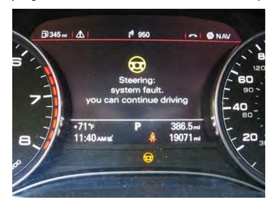
Figure 1. Yellow steering symbol and cluster message.

The yellow steering symbol is illuminated in the instrument cluster. A DTC C10ACFO – steering end stops not programmed is stored in address word 44 power steering (J500).