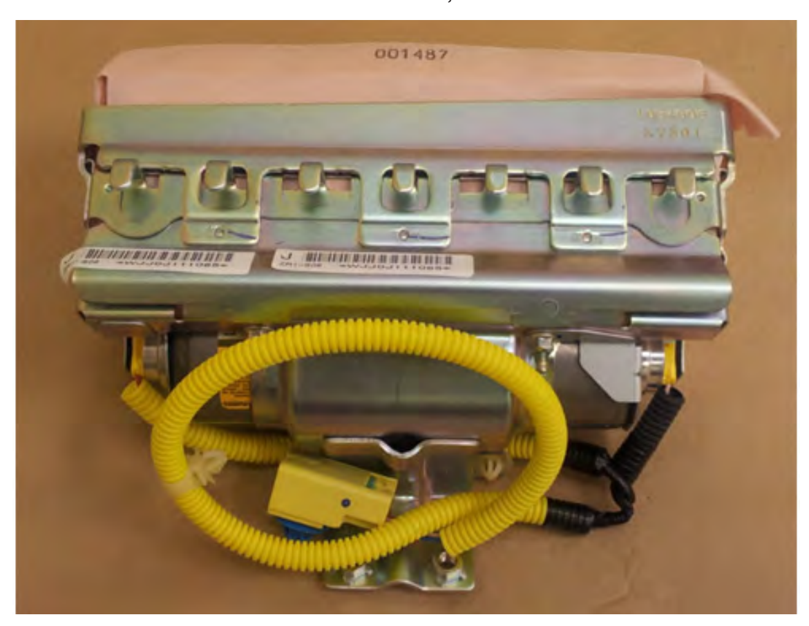
PASSENGER AIR BAG MODULE, 2008 FORESTER