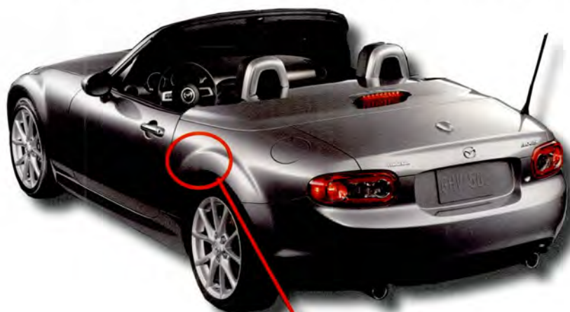
Original Factory Power Retractable Hardtop Module

Note: This condition may or may not store multiple CAN system DTCs.