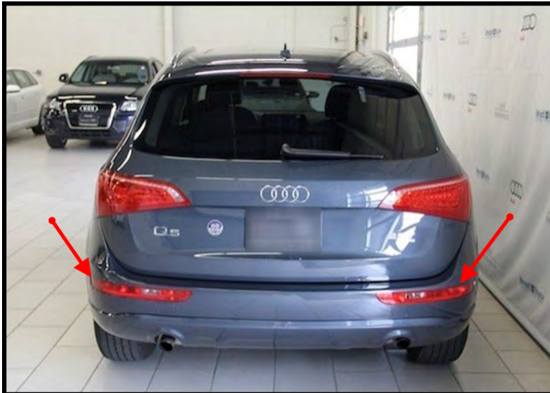
Figure 1. Rear side marker lights.

A bulb out warning is active in the instrument cluster's driver information system display and one or both of the rear side marker lights are burnt out.