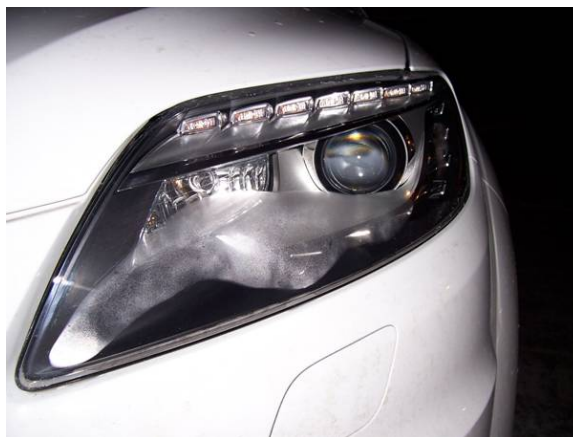
Figure 1. Moisture in headlamp.