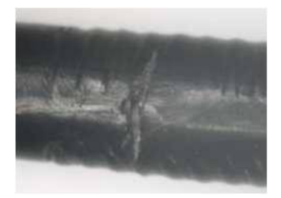
Figure 1. Cut in Bowden cable.

When the vehicle is entered through a different door and moved to a location where it can be warmed, the outside door handle becomes operative.