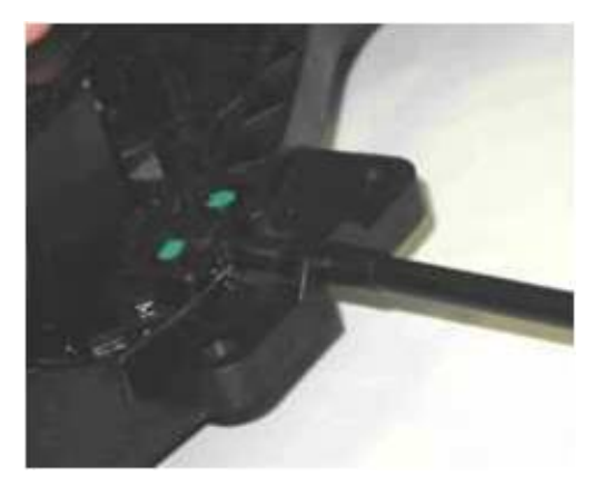
Figure 3. Bearing bracket with two green dots.

If two green dots are present on the replacement parts, then proceed to step 3.