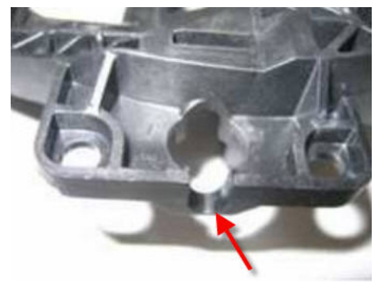
Figure 4. Location on bearing bracket to check for burrs.

Apply a protective fabric strip around the Bowden cable where it touches the bearing bracket.