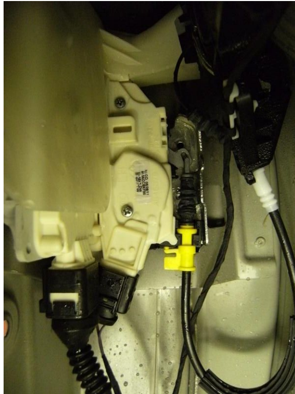
Figure 1. Bowden cable routing.

When fitting the Bowden cable from the mounting bar to the door lock the cable can get kinked. In some cases this can increase the inner friction of the strand in the Bowden cable. As a result, the door lock stays in pressed position or does not completely return to its zero position. (Figure 1).