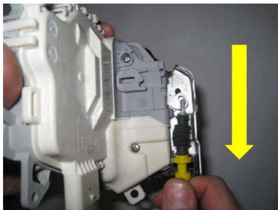
Figure 4. Pulling down the Bowden cable.