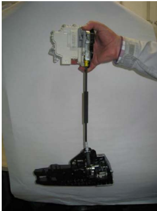
Figure 5. Do not turn the lock or the mounting bar.