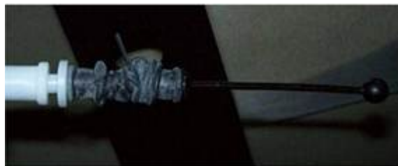
Figure 2. Distorted rubber grommets.

When the Bowden cable gets twisted during the installation the rubber grommets can get distorted. Consequently, the Bowden cable has a too high inner friction and the door lock does not move to the zero position. (Figure 2).