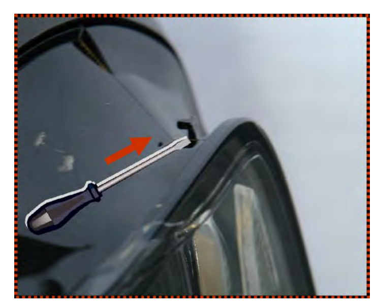
Figure 2. Direction to remove clip.

2. Apply screwdriver and remove clip with a gentle tap (left and right headlight).