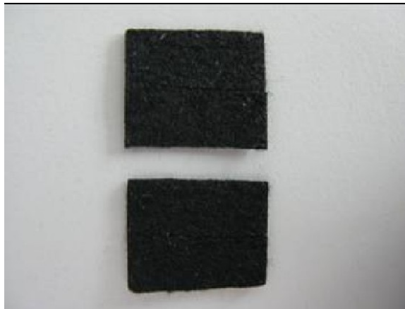
Figure 1. Felt pieces.