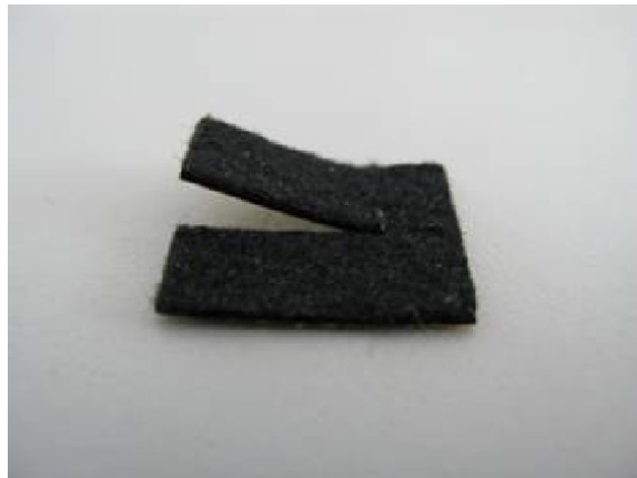
Figure 2. Cutting felt.