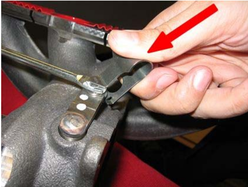
Figure 1. Fit the clip from the side.