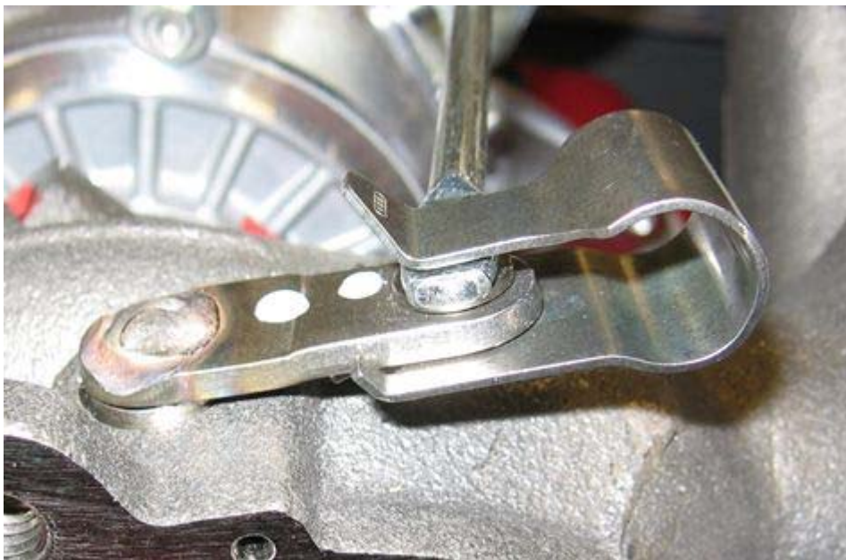
Figure 4. Correctly fitted clip.