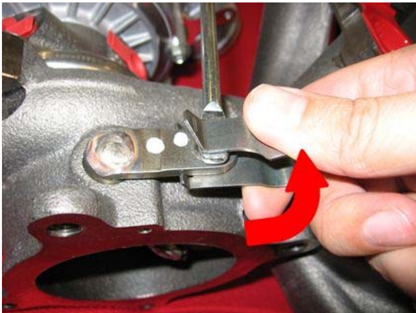
Figure 2. Turn the clip counter clockwise till the lugs slot in.