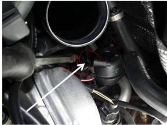
Figure 2. Vacuum hose not connected.