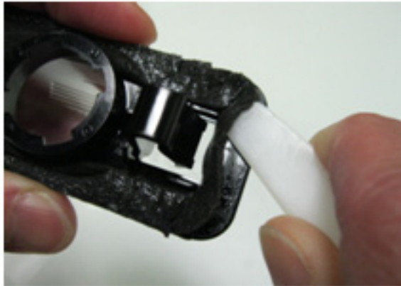
Remove the original packing and adhesive. (Bulb socket installed)