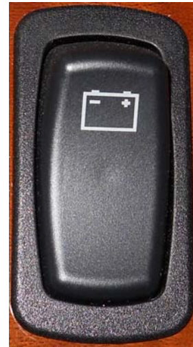
Battery Boost Switch