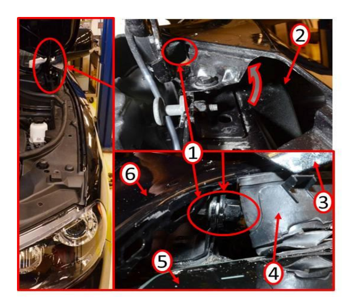
Fig. 3 Hood Hinge Pivot Bolt Removal