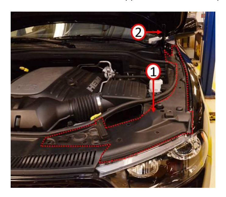
Fig. 1 Remove Fender Closeout