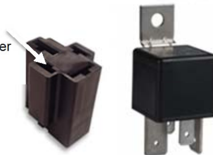
FORMER RELAY BASE