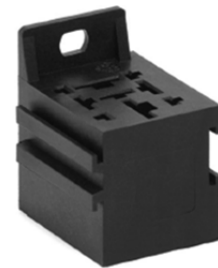
NEW RELAY AND BASE