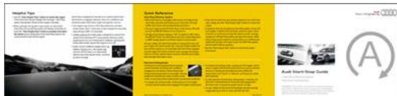
Figure 2. New Start-Stop glovebox insert.