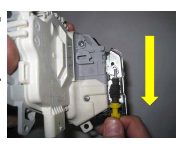
Figure 4. Pulling down the Bowden cable.

Slot in the yellow locking mechanism to the left