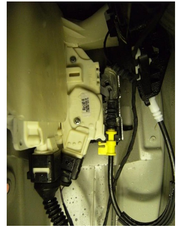
Figure 1. Bowden cable routing.

When fitting the Bowden cable from the mounting bar to the door lock the cable can get kinked. In some cases this can increase the inner friction of the strand in the Bowden cable. As a result, the door lock stays in pressed position or does not completely return to its zero position. (Figure 1).