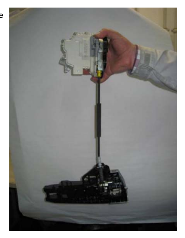
Figure 5. Do not turn the lock or the mounting bar.

c. Do not twist the Bowden cable after the installation. To achieve this, turn neither the lock nor the mounting bar.