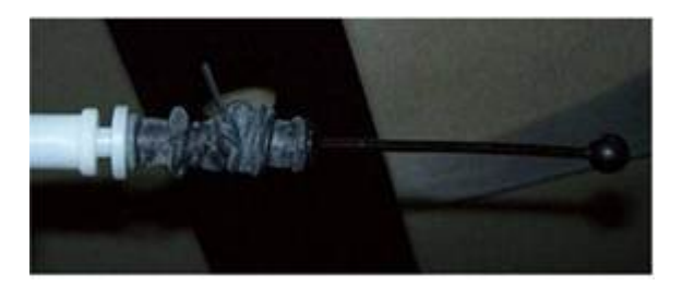
Figure 2. Distorted rubber grommets.

When the Bowden cable gets twisted during the installation the rubber grommets can get distorted. Consequently, the Bowden cable has a too high inner friction and the door lock does not move to the zero position. (Figure 2).