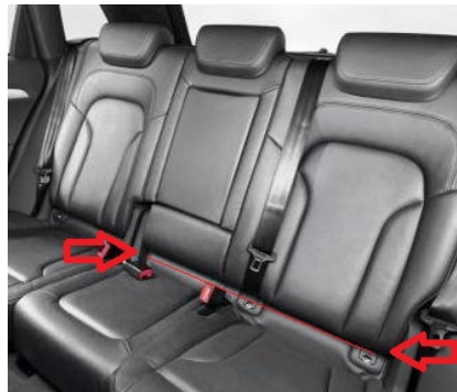
Figure 1. Left rear seat noise area marked with red arrows.

The rattle sound can be caused from the pivot point of the torsion bar (Figure 1) within the 2/3 rear seat backrest pivot assembly.