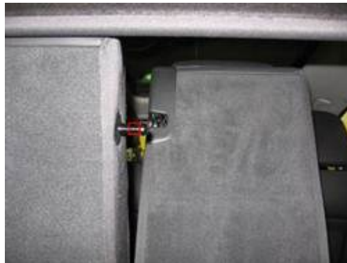
Figure 4. Area of striker pin to be lightly sanded.

Should a squeak be heard and it is determined that the source of the squeak is the armrest lock, lightly sand the contact surface of the striker pin to create a “knurled” effect.