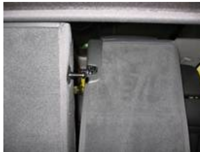
Figure 2. Armrest lock striker pin.

The squeak noise may be coming from the rear seat armrest area, specifically from the contact surface between the armrest lock and the striker pin.