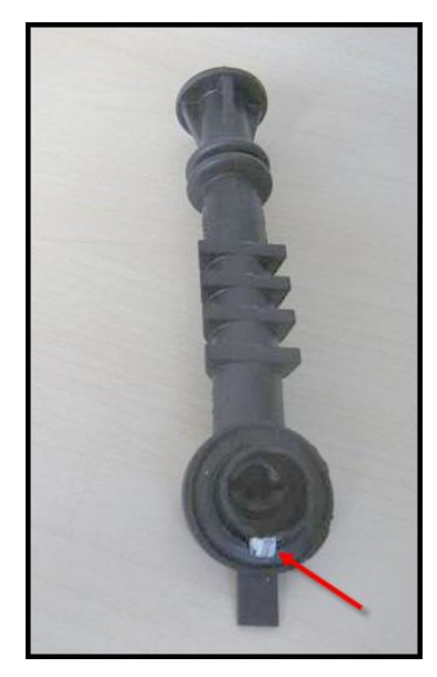
Figure 3. White mark on locating tab.

Service parts have been checked, but it is still possible to receive unchecked parts. Corrected parts will be marked in white on the locating tab. This tab must be pointing down (Figure 3).