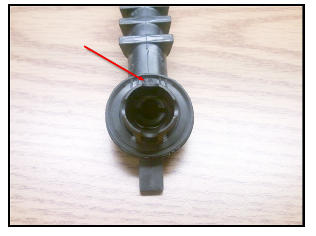
Figure 1. Incorrectly assembled drain hose, with locating tab pointing up.