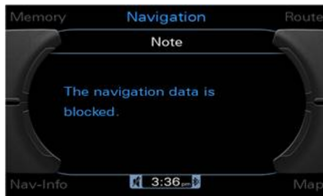
Figure 8. Navigation data blocked error screen.

Tip: Remember to remove the SD card from the vehicle.