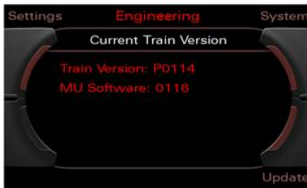
Figure 3. Engineering menu.