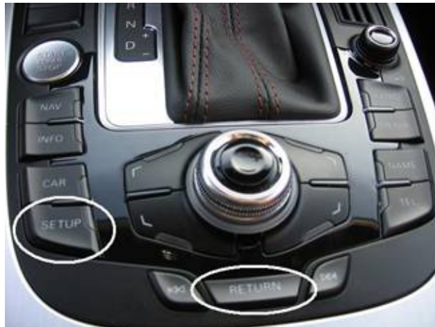
Figure 2. SETUP and RETURN buttons.