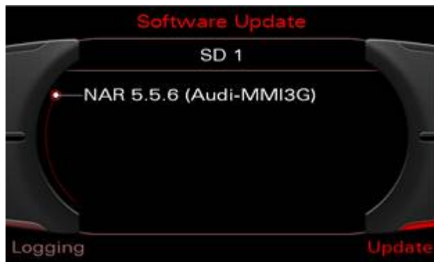
Figure 5. Selecting the navigation data compilation.