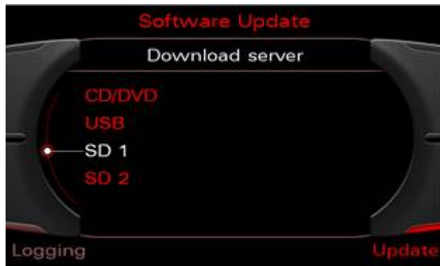
Figure 4. Selecting the correct media source.