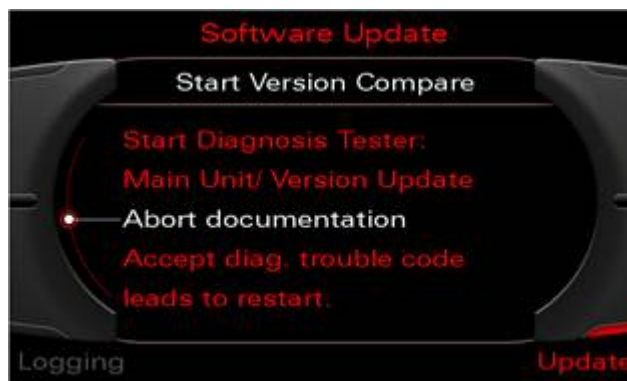
Figure 6. Selecting "Abort documentation" .