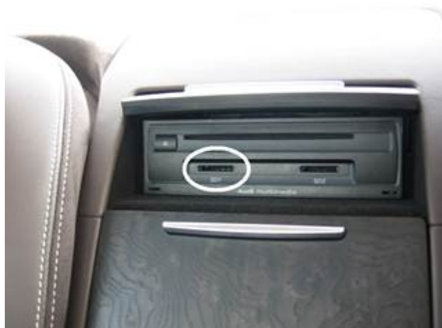
Figure 10. SD card slot 1 of rear main unit J829.