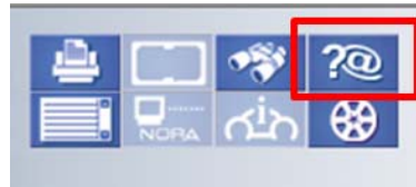
Figure 1. Link to ETKAinfo.com in ETKA.

The SVM code can be found in Parts Bulletin 9-97. All parts bulletins are located on the ETKAinfo.com website. The link to ETKAinfo.com is indicated by the icon seen in Figure 1.