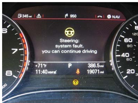
Figure 1. Yellow steering symbol and cluster message.

The yellow steering symbol is illuminated in the instrument cluster. A DTC C10ACFO – steering end stops not programmed is stored in address word 44 power steering (J500).